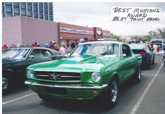
2005: RMCC Street Hop Winner

Anybody know whose car this is? It won Best Mustang and Best Paint at this show at Diamonds Casino in Reno, April 24, 2005.